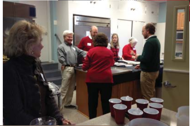
(above & at right - views of the room)