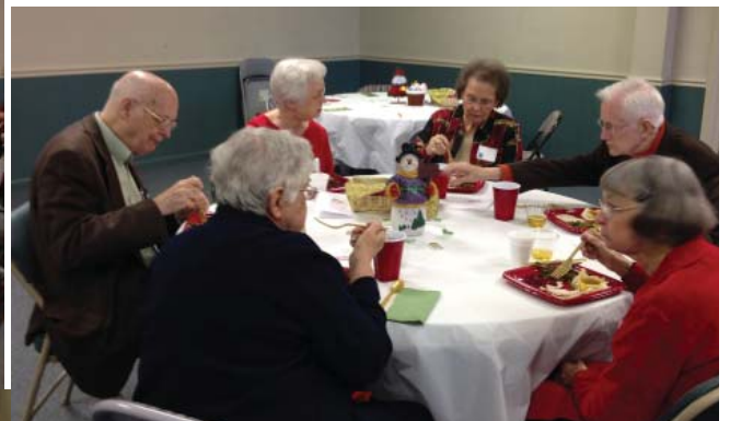
guests for the occasion - above, above right, at right