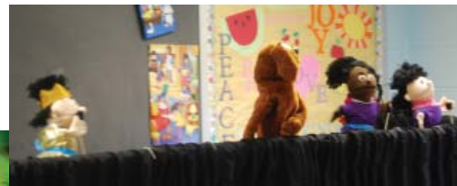
Crafts (above), puppets (left) and games (below)