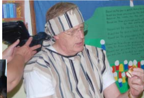
Class time (left)