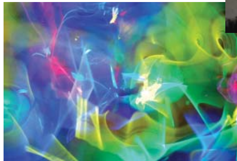
(right) This is a photo of the children swish- ing around their glow- in-the-dark bracelets, part of the lesson about Nicodemus approaching Jesus at night.