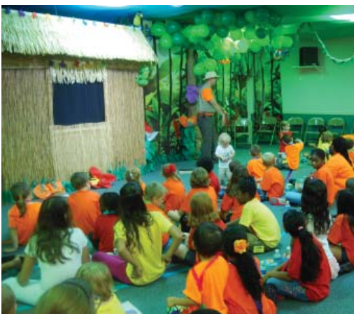
(Upper left) group ceremony - note the VBS shirts by Arlington (above) Vacuuming is also a service. (right) Close up of the trees with the balloon leaves