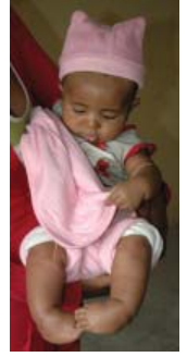
Hopeful families (above) waiting for help for their children. At right are some of the children helped last spring.