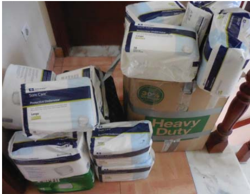
Diapers for severely disabled youth

During my November, 2014 trip I visited the Sele Enat Orphanage near the Addis Ababa congregation. The home cares for over 180 children, most of whom have been abandoned due to rape or death. The home also has 11 adolescents who are severely disabled and require one-to-one assistance. During one visit, the director told me that the greatest problem was finding big diapers for these children. I wanted to do something to create the connection between the church and the orphanage, so I took 800 pull up diapers donated to the orphanage. Please pray that this relationship will continue and we will be able not only to provide their physical needs but their spiritual needs as well.