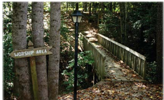
path through the woods