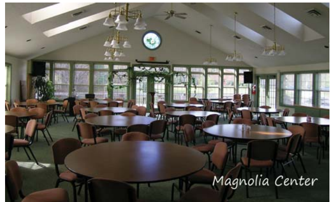
One of the meeting centers