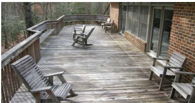
The deck outside one of the lodges - a great place to visit with friends or just enjoy the view.