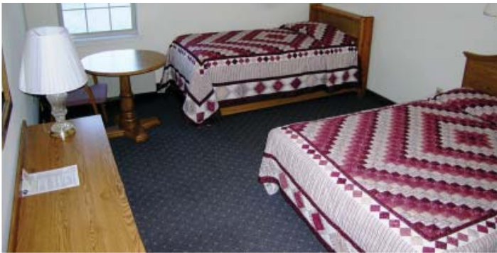
A room in Oakwood Lodge