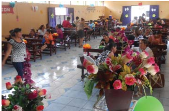
(above) Meeting of a Ladies National Committee comprised of representatives from Church of Christ congregations throughout Nicaragua.