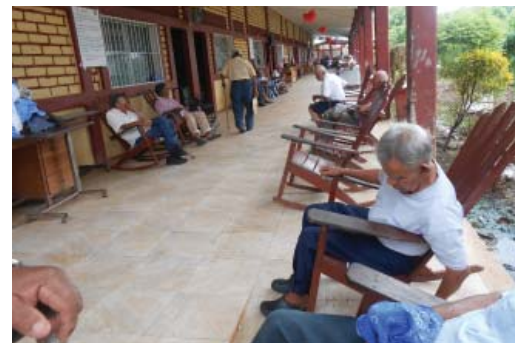
(At right) Visiting with residents