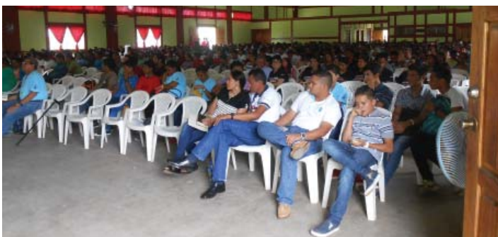
(below) A well-attended youth event held in Leon, Nicaragua, about 75 miles northwest of Juigalpa.