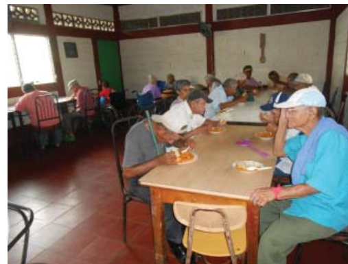
(Above) Residents of a retirement home enjoy a meal provided by members of the Juigalpa congregation.