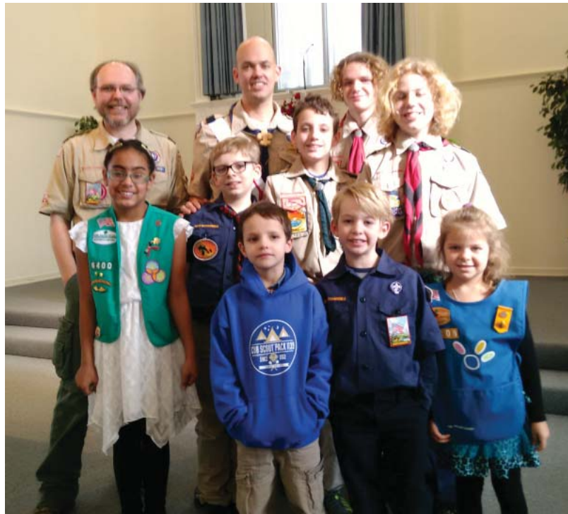
A great group of scouts and scouters turned out for our annual participation in Scout Sunday.